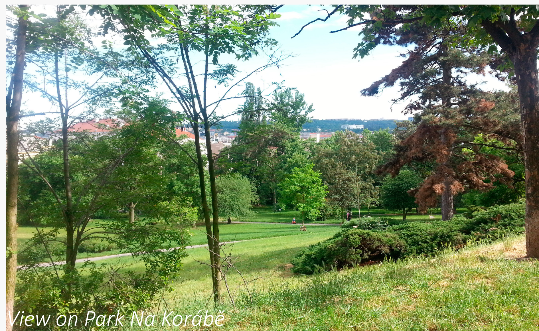
View on Park Na Korábě