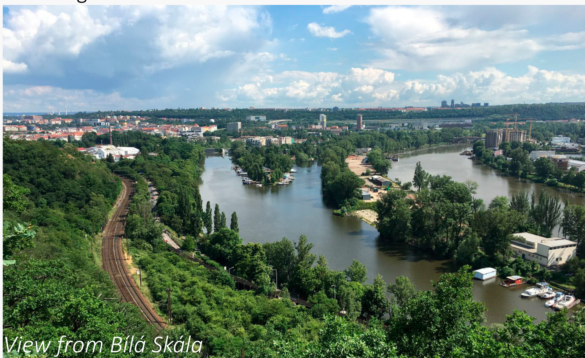
View from Bílá Skála

The analysis is focused on the community garden, protected nature area Bílá skála and surrounding areas, the allotment gardens, park Na Korábě, part of the hospital Bulovka, a cemetery and the sports centre Na Korábě. The main issues of the area and are presented under the following themes.