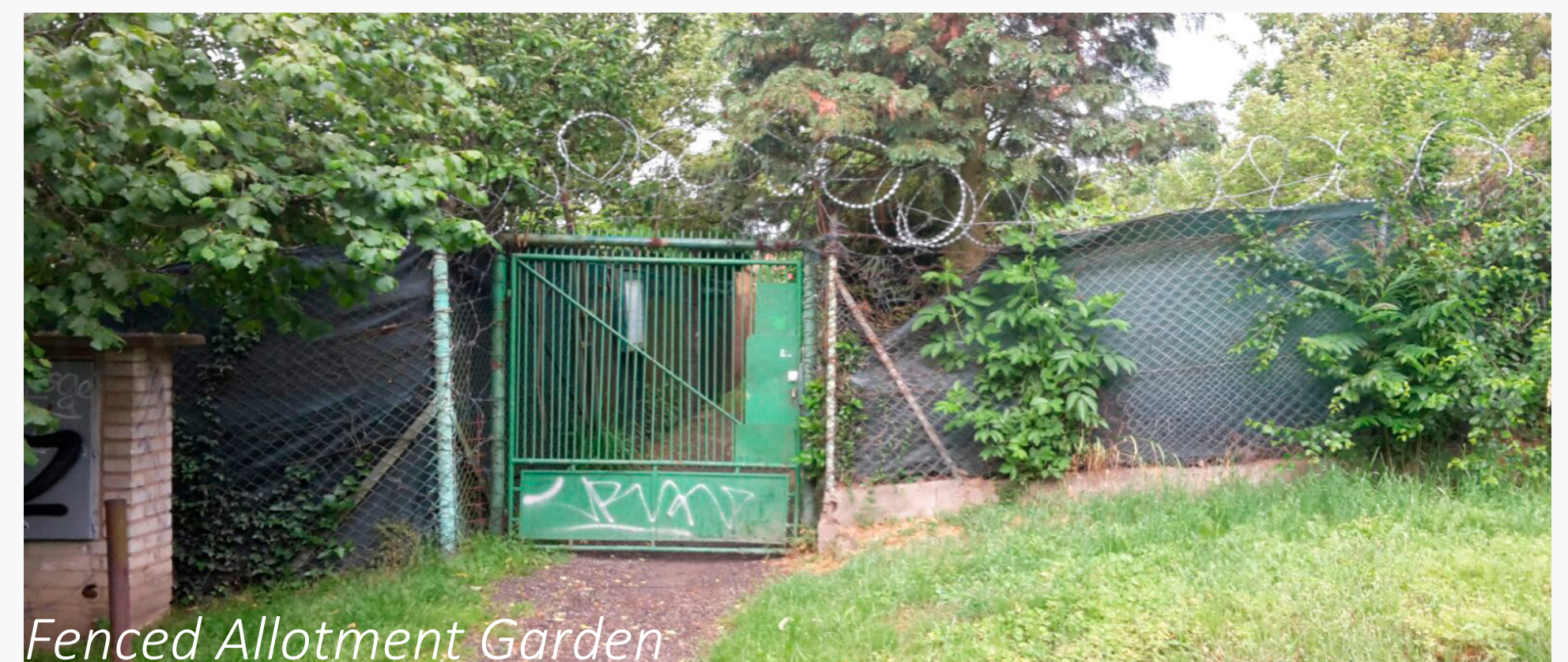
Fenced Allotment Garden