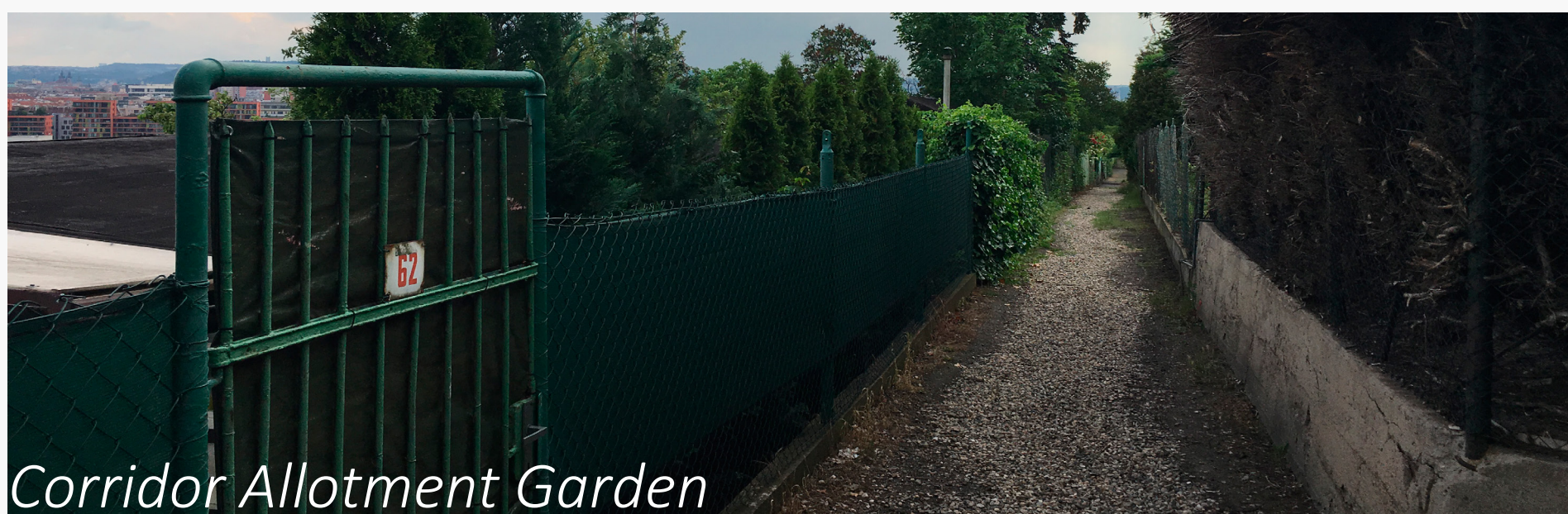
Corridor Allotment Garden